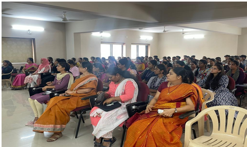
Speaker explaining about career guidance to all the students