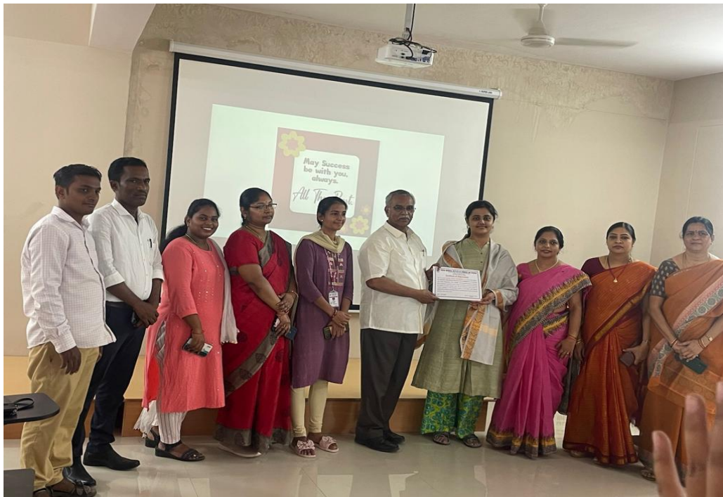
Felicitation of the guest speaker