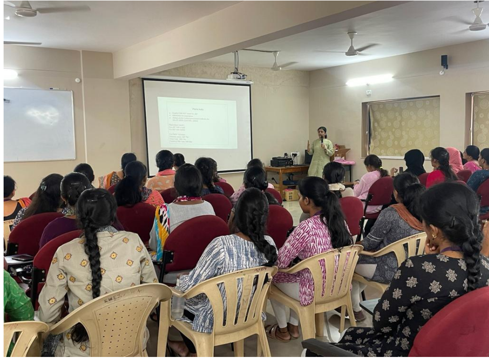
Speaker interacting with students